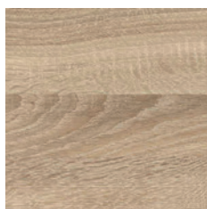
.BE bardolino natural oak